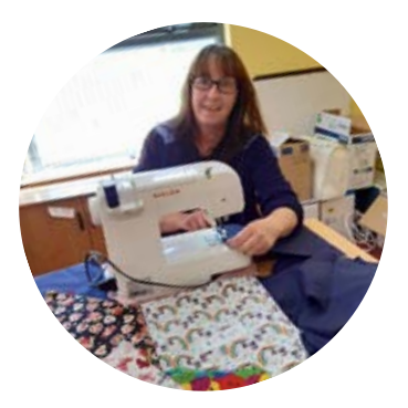
Mask making as part of the Face Mask Project

The Traveller Development worker along with Shannonside Women's Group made and dispatched the masks following Covid safety guidelines. Masks were divided into packages and delivered to each family in the Traveller Community in Leitrim.