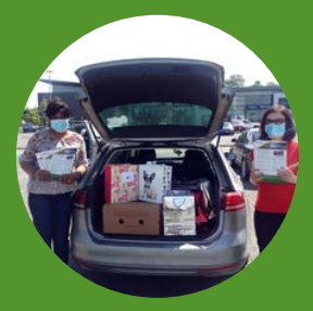
Delivery of COVID-19 Response Newsletter to the community

SICAP aims to address high and persistent levels of deprivation through targeted and innovative, locally-led approaches. It targets and supports those who are disadvantaged in Irish society and less likely to use mainstream services.